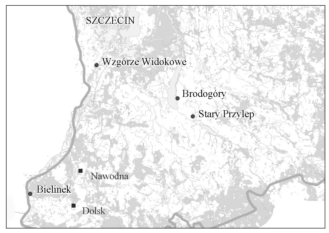
Fig. 1. Some xerothermic areas in the Western Pomeranian Region; • - protected, • - not protected.

Floristic observations on the xerothermic grasslands of the western part of Pomerania in Poland were initiated in 1995 [15] and continued off-and-on until 2007 [16, 17]. The results presented here are a part of research carried out in 2000-07 within xerothermic reserves in Bielinek, Brodogóry and Stary Przylep, as well as within unprotected areas, i.e. in the vicinity of Dolsko and Nawodna (Fig. 1). In the selected grassland patches, phytosociological relevés were made with the classic Braun-Blanquet [18, 19] method. Two separate scales were used: a combined cover-abundance scale (+: below 1%; 1: 1-5%; 2: 5-25%;